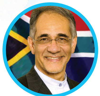
Mr Enver Surty, Deputy Minister of Basic Education