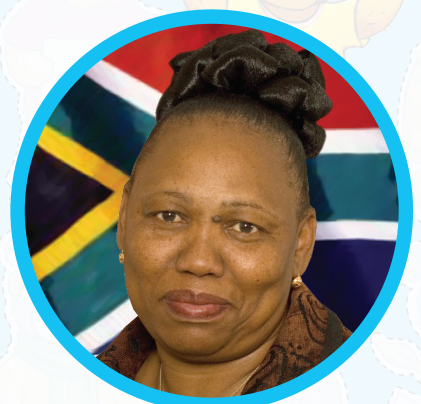
Mrs Angie Motshekga, Minister of Basic Education